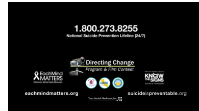
Through the Lens of Culture