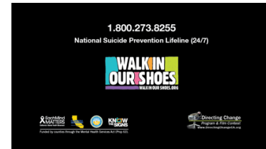
Walk in Our Shoes