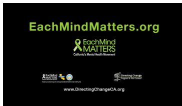
Mental Health Matters

Number Four: My film includes the required end slate. Each category requires an end slate with compilation image of logos and resources which should appear at the end of your film and within the 30 or 60 second limit.