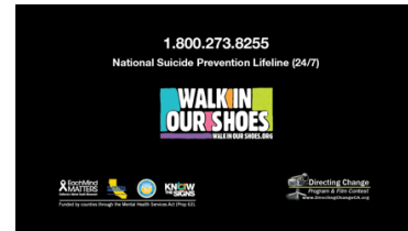
Walk in Our Shoes