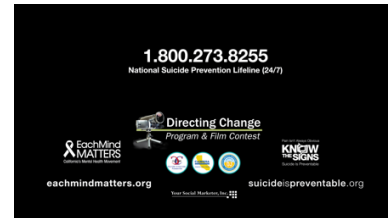
Through the Lens of Culture